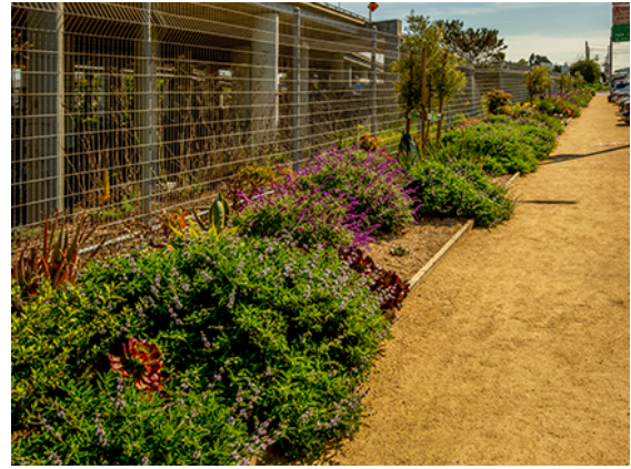
Iowa St Greening, Proposed; Pennsylvania Ave Greening, nearby

There is a small strip of land adjacent to SFMTA’s Wood Yard bus facility and opposite the 22 nd St Caltrain Station, which the GBD upgraded in 2019. On the opposite side of the Caltrain line is the Pennsylvania Avenue gardens that the GBD created in 2016. The Gears parcel is the next block south of this stretch of Iowa. The planting would