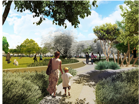
Esprit Park, Proposed

At 1.8 acres, Esprit Park is, by far, the largest greenspace in Dogpatch and the only facility managed by the Recreation and Parks Department. But the much-loved park is struggling to withstand current usage levels and is ill prepared for the thousands of new residents relocating to Dogpatch. An updated concept plan for the park was developed by Fletcher Studio as part of the Planning Department’s Public Realm Plan. The park was confirmed as a priority at the community task force convened by UCSF. UCSF’s resulting pledge of $5 million toward the renovation has accelerated the project. The GBD is helping to realizing the community’s vision for the park by: