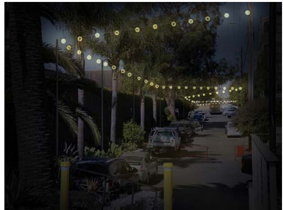
Angel Alley, Existing (left) & Concept Lighting (right)

The original improvements to Angel Alley – the rock retaining walls, succulent plantings, the Black-eyed Susan and trumpet vines along the fence – were installed by neighbors in self-defense, to mitigate the neglect and ugliness of the half-wide street and create a safer, happier place. Those improvements, plus the exploding growth north and south of Angel Alley, which now connects the Minnesota Street Project studios and galleries and the new apartments in south Dogpatch to the neighborhood’s 22 nd St. commercial corridor and the American Industrial Center and Mission Bay to the east and north, has made Angel Alley a prime north/south pedestrian and bike route in Dogpatch.