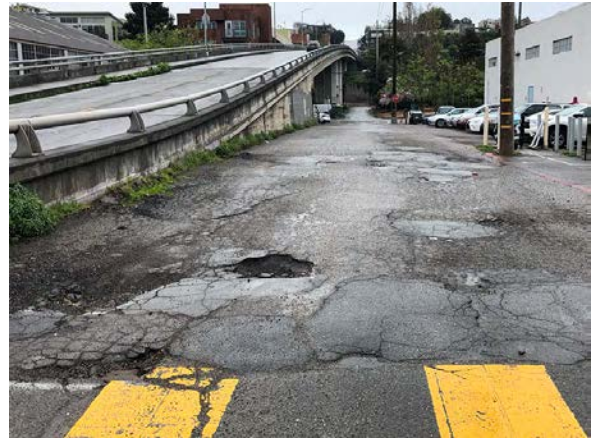
20 th Street's crosswalks to nowhere

Dogpatch's infrastructure is fractured and incomplete, especially when it comes to pedestrian paths of travel. Advocating for pedestrian planning has become a key function of the GBD. Some of the most challenging conditions exist as a result of the large overpasses at 18 th and 20 th Streets. The descending, freeway-scale roadways narrow surface streets, create awkward and dangerous intersections, and contribute little but darkness and debris to the areas around them.