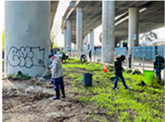
The freeway parcel known as the Gears

The Gears parcel is the last large, sunny Caltrans parcel in the district alongside the 280 freeway. Plans were underway to remove the existing mature ash trees and pave the lot for Food Bank parking. The GBD was able to find a better location for Food Bank parking and then lease the lot from Caltrans. In the short term, the GBD and neighborhood volunteers are cleaning the lot. The GBD is in the process of replacing the ragged fencing and improving management of the stormwater that flows from the freeway in to the lot. The GBD will use a small portion of the lot for maintenance storage as the scope of the GBD’s maintenance work continues to increase annually. We are consulting with neighbors on possible short and long term uses for the lot.