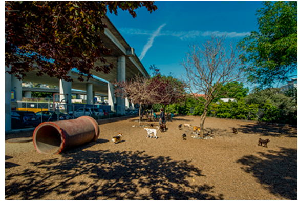
Current dog run and potential nursery site looking south, and north

The GBD was approached by the San Francisco chapter of the California Native Plant Society about possibly partnering on a native plant nursery for the purpose of propagating and distributing San Francisco native plants, especially native live oaks. The GBD has also discussed the possibility of providing a temporary staging area for Public Works trees and plants. The local CA Native Plant Society president and the founder of the Mission Blue Nursery suggested relocating the GBD’s current Progress Park dog run and using that space for natives propagation. If the GBD is successful in obtaining a long term lease on the Gears parcel, and if neighbors deem it appropriate to relocate the dog run to that parcel - which is much larger, located closer to neighborhood center, and less encumbered by traffic and industry – then the existing dog run would be a perfect size and exposure for the nursery, which would