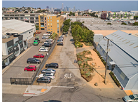
Minnesota Grove Extension, before and after

Dogpatch south of 23 rd is a tumble of unaccepted streets lacking sidewalks, crosswalks, lighting and drainage. It also hosts the City’s largest concentration of PDR (light manufacturing) businesses, several large residential complexes and, more recently, world-famous galleries, artists’ studios, trendy restaurants and breweries. At the heart of all that is Minnesota Street and the Minnesota Grove – a block long urban forest. It has been a long time dream of neighbors and local businesses to complete the Grove all the way south to 25 th Street. The recently completed extension: